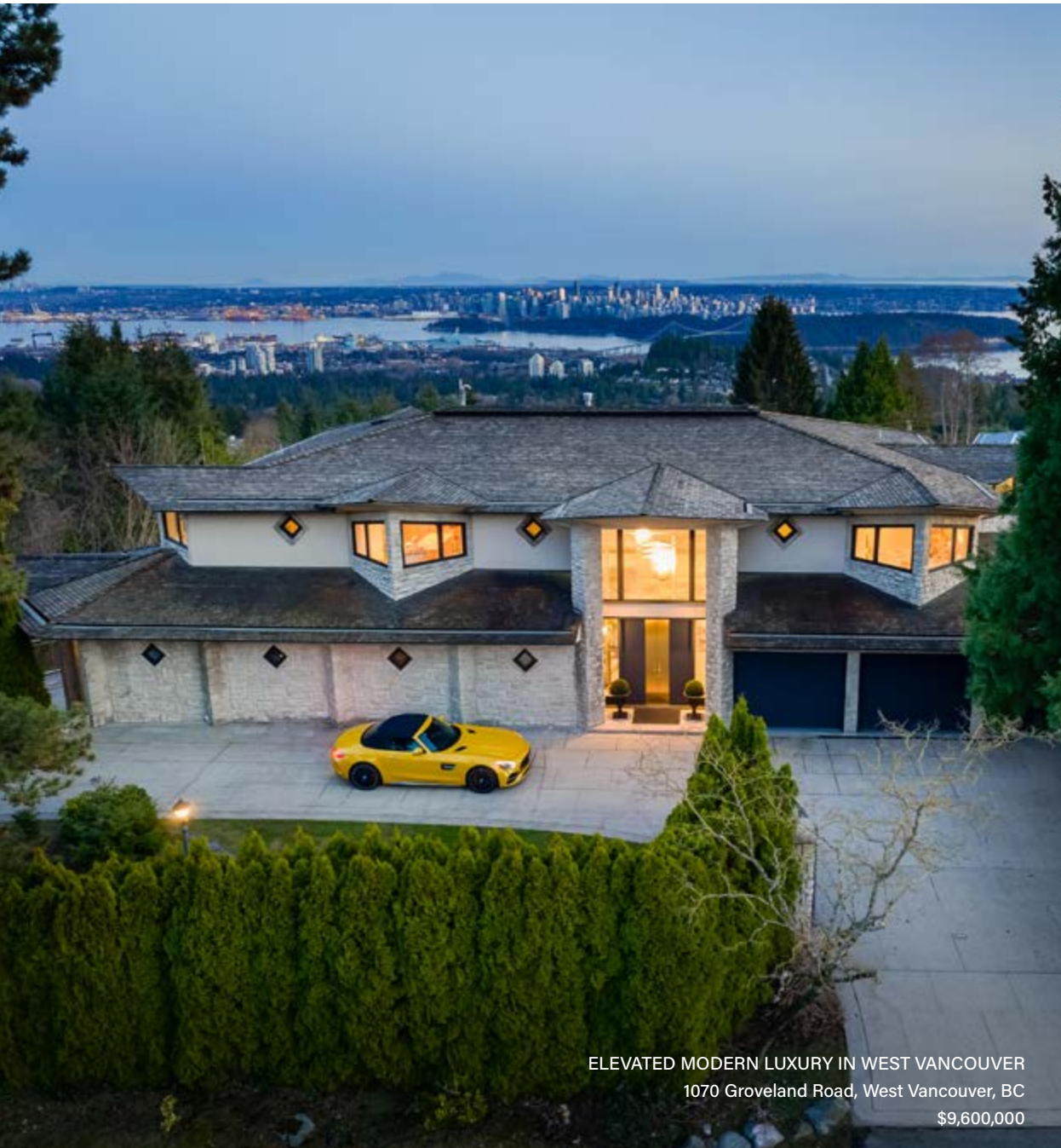
ELEVATED MODERN LUXURY IN WEST VANCOUVER 1070 Groveland Road, West Vancouver, BC $9,600,000